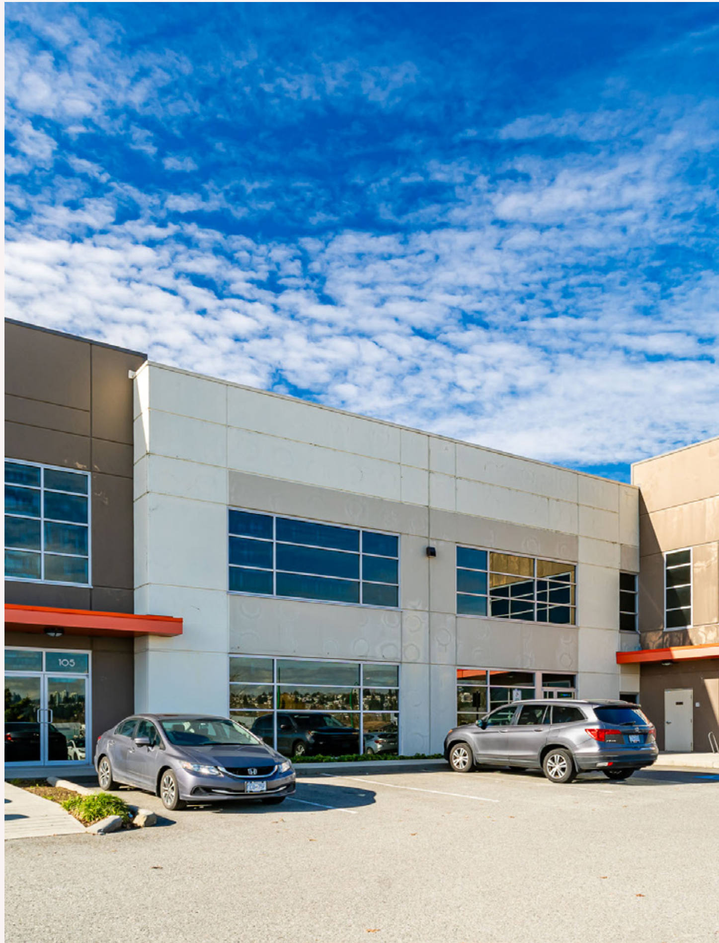
#105 - 7337 NORTH FRASER WAY, BURNABY, BC