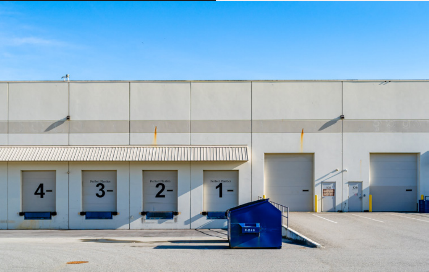
#105 - 7337 NORTH FRASER WAY, BURNABY, BC