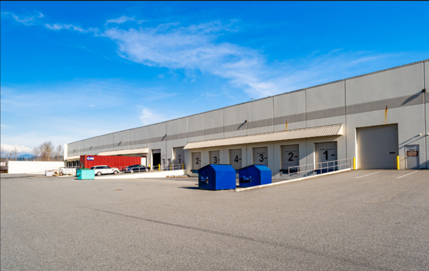
#105 - 7337 NORTH FRASER WAY, BURNABY, BC